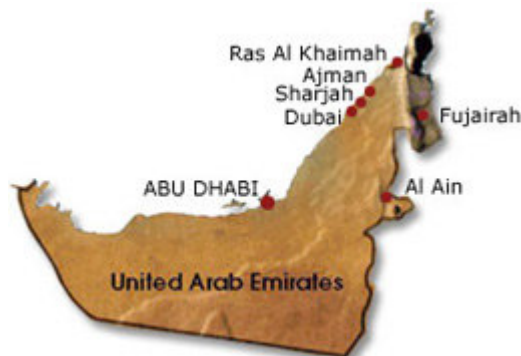
Fig 1. Map of United Arab Emirates